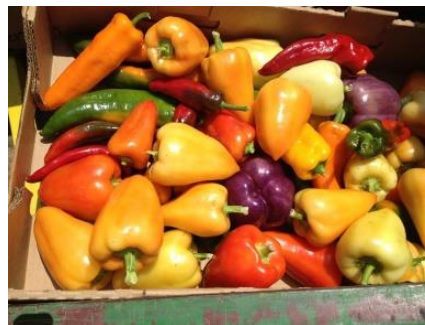
Bounty of Peppers