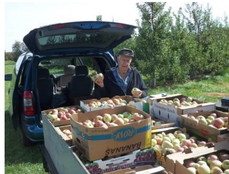
Harvest from Pittstown

The Project has many helpful volunteers that can coach you on tasks that need to be done.