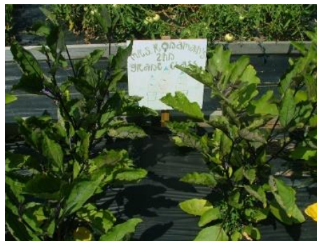
One of the Growing To Give beds.

Your company may schedule a "Volunteer Day" working in the garden by contacting the WFA Office Manager by phone at 908-350-7383 or email ggp@wfafnj.org