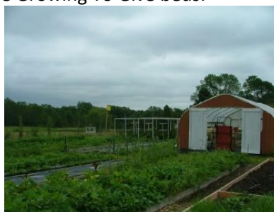
GGP garden in July